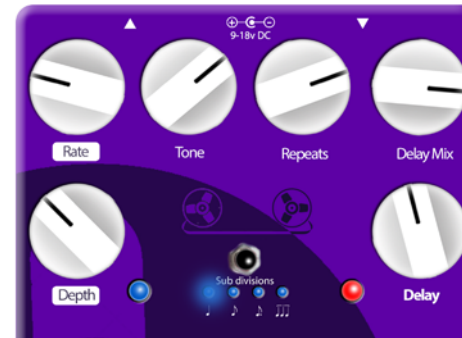
You better run!!