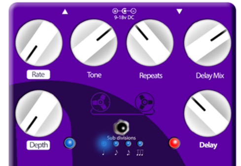
On the Edge

WAMPLER Pedals Limited Warranty. WAMPLER offers a five (5) year warranty to the original purchaser that this WAMPLER product will be free from defects in material and workmanship. A dated sales receipt will establish coverage under this warranty. This warranty does not cover service or parts to repair damage caused by accident, neglect, normal cosmetic wear, disaster, misuse, abuse, negligence, inadequate packing or shipping procedures and service, repair or modifications to the product, which have not been authorized by WAMPLER. If this product is defective in materials or workmanship as warranted above, your sole remedy shall be repair or replacement as provided below. RETURN PROCEDURES. In the unlikely event that a defect should occur, follow the procedure outlined below. Defective products must be shipped, together with a dated sales receipt, freight pre-paid and insured directly to WAMPLER SERVICE DEPT – 3383 Gage Ave., Huntington Park, CA 90255, USA. A Return Authorization Number must be obtained from our Customer Service Department prior to shipping the product. Products must be shipped in their original packaging or its equivalent; in any case, the risk of loss or damage in transit is to be borne by the purchaser. The Returns Authorization Number must appear in large print directly below the shipping address. Always include a brief description of the defect, along with your correct return address and telephone number.