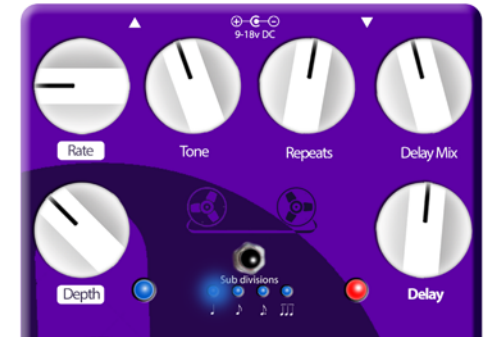
Ultimate Solo Enhancer